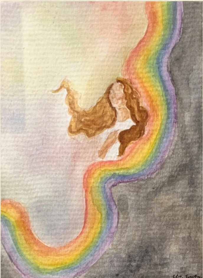
Coming Out Into the Light Eliza Freestone