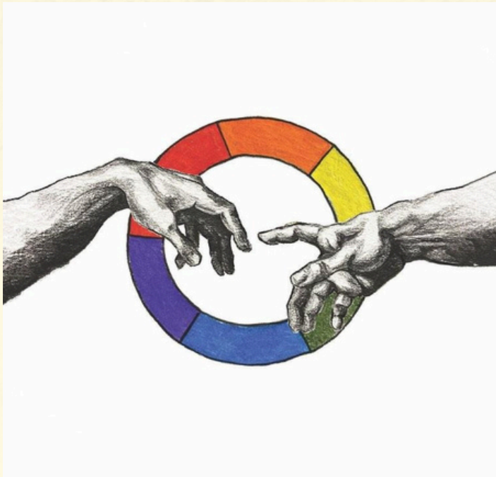
A Touch of Color Jess