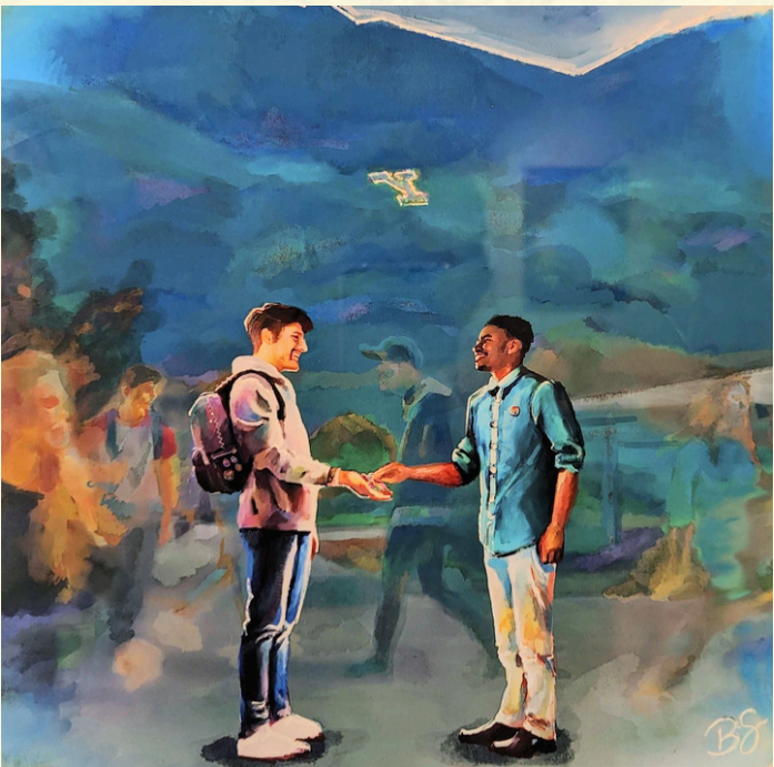
Trading Glances Brooklyn Skidmore